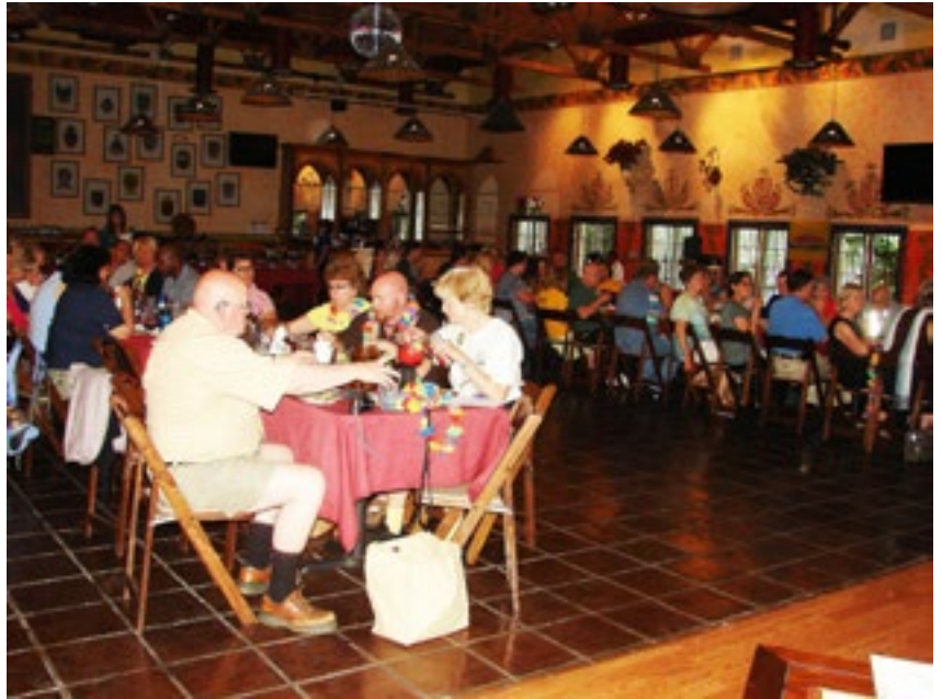
Interweave Continental GA Banquet 2012