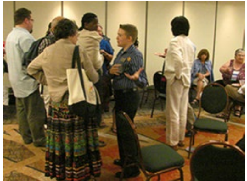
2012 Minister's Reception

Minister's Reception , co-sponsored by the UUA and Interweave Continental, will take place on Saturday evening, June 22, at 7:00 - 8:30pm, just before the Ware Lecture!! Ministers, ministerial students, and allies are welcome to join in conversation and in celebration of each other, as you provide important role models and leadership to the LGBTQ communities both within and outside of our congregations. We honor you and invite you to meet and to exchange ideas and experiences.