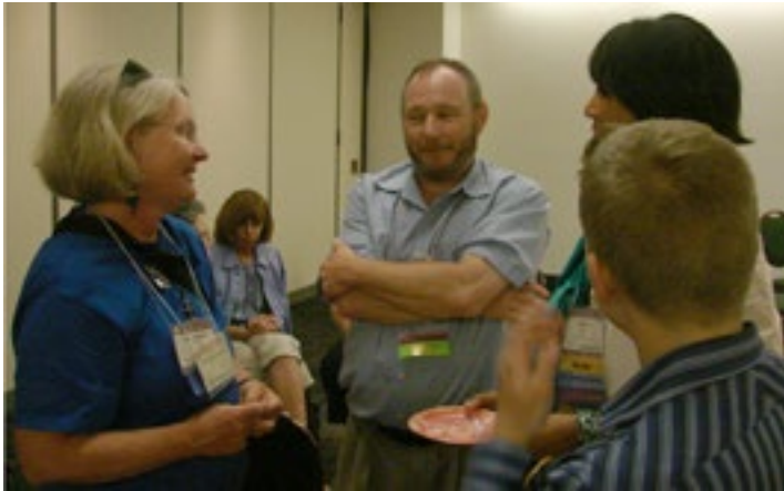
2012 Minister's Reception

Minister's Reception , co-sponsored by the UUA and Interweave Continental, will take place on Saturday evening, June 22, at 7:00 - 8:30pm, just before the Ware Lecture!! Ministers, ministerial students, and allies are welcome to join in conversation and in celebration of each other, as you provide important role models and leadership to the LGBTQ communities both within and outside of our congregations. We honor you and invite you to meet and to exchange ideas and experiences.